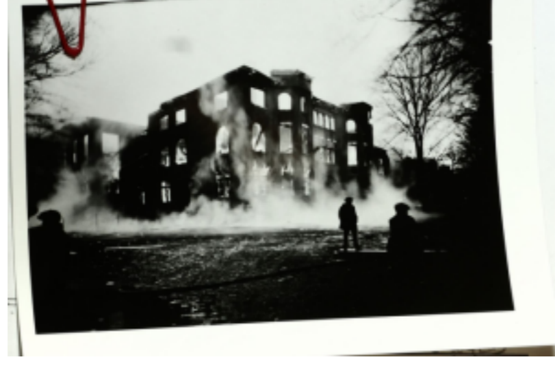
The smoking ruins of the Normal School.

The fire occurred in the early hours of Feb. 27th, 1919, at the Cortland Normal School. It's thought that the paper chute caught fire, from the "bottom to the top of the shoot" and moved straight to the 3rd floor (1). No one was injured or killed and over half of the library and records in the school were saved, everything else was lost (4). Classes resumed March 3rd at the YMCA and Church site directly after the fire, so the students' educations weren't greatly affected (2). Offices also opened in the Savings Bank Building (3). Damages to the school ultimately ranked up to be $150,000 plus (4).