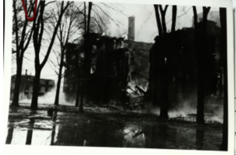
After the fire was put out at the Normal School.

There was a plethora of arguments surrounding the new location of the Normal School. Many wanted the Randall Flats location, but others favored the Hill, where the school eventually ended up (3). Another potential mystery or suspicious fact surrounding the fire is that there was already debate about moving its location before the fire ever occurred; "Plans have been underway for some time for the erection of a new school at Cortland and controversy over the site has existed in the city" (3, 4).