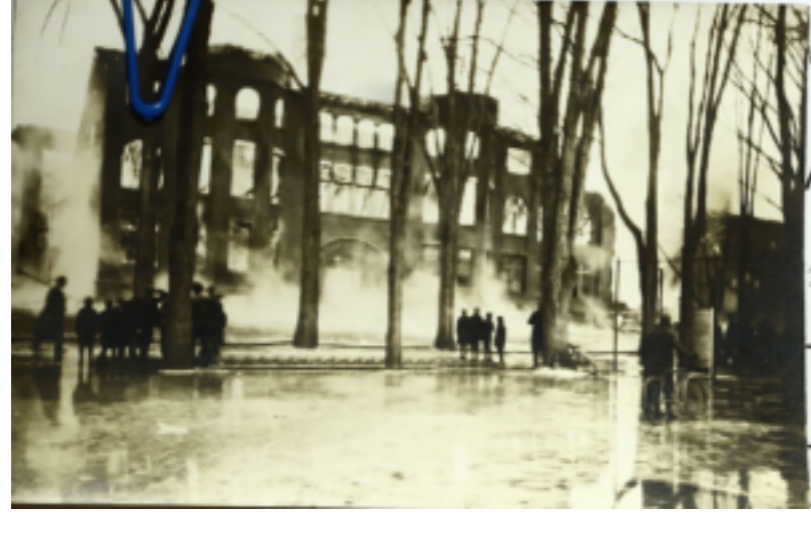
People gathered at the burning building.