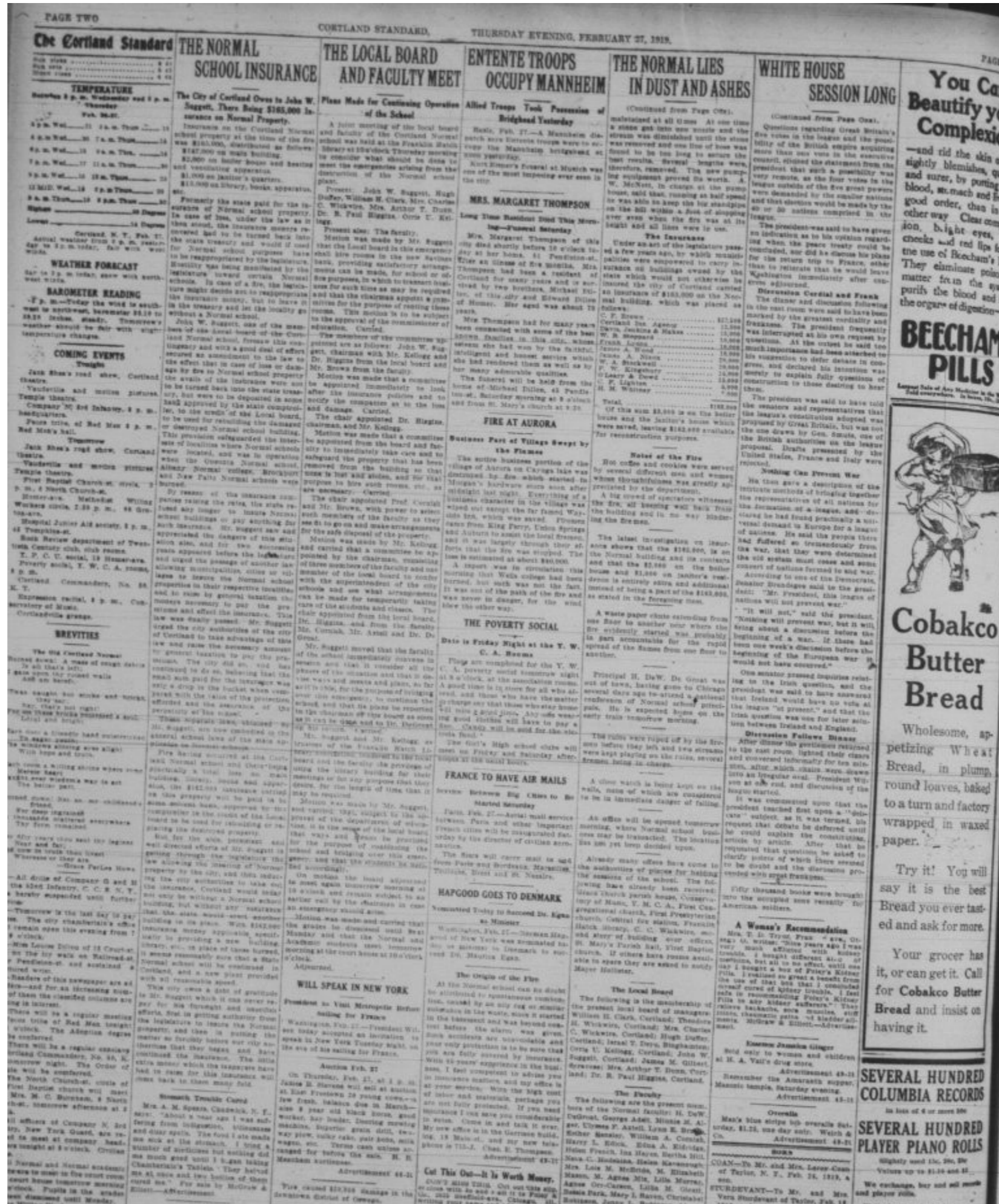
The fire at the Normal School was covered wholly by the insurance.