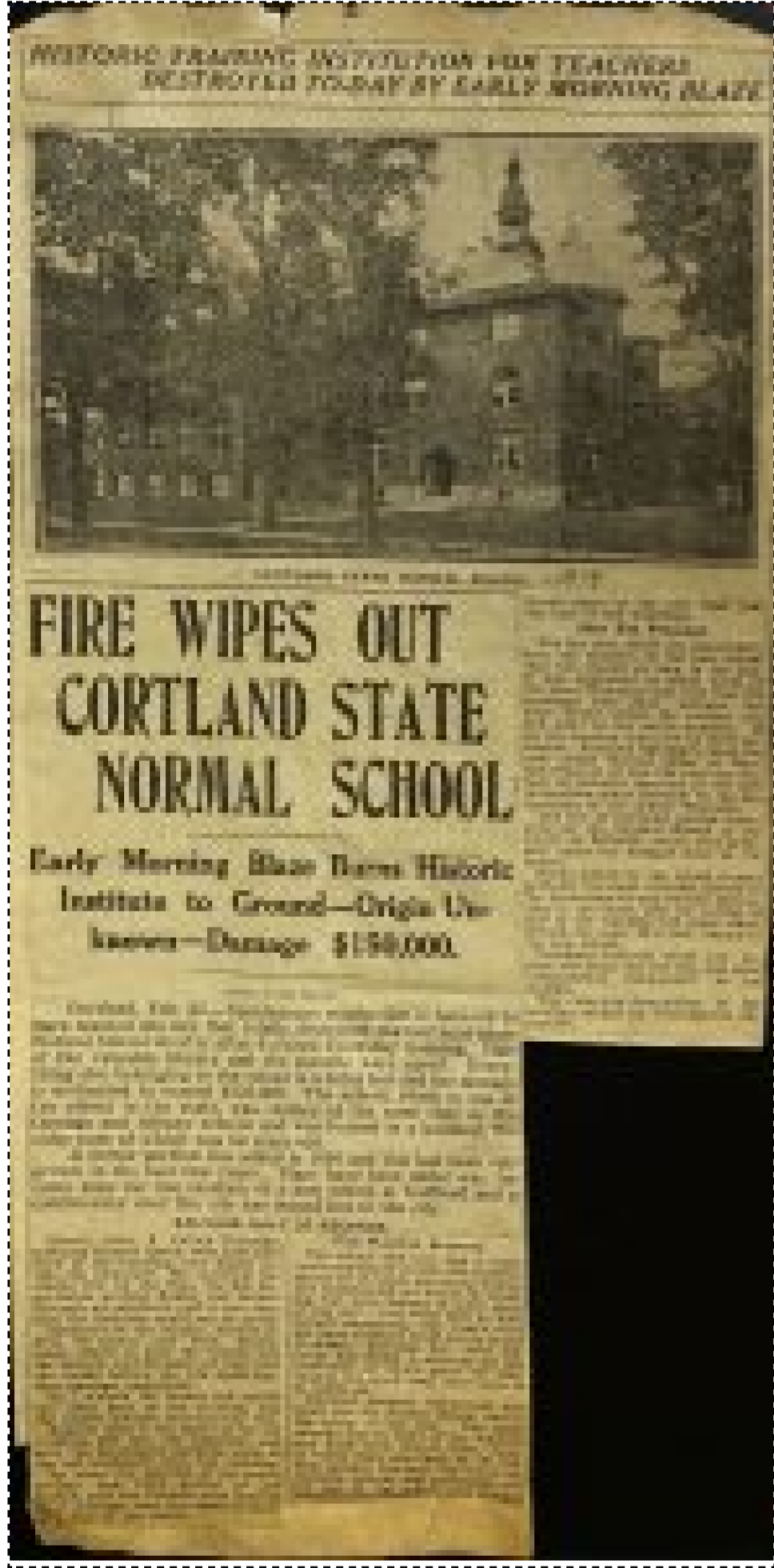
Newspaper Reflecting on the Fire