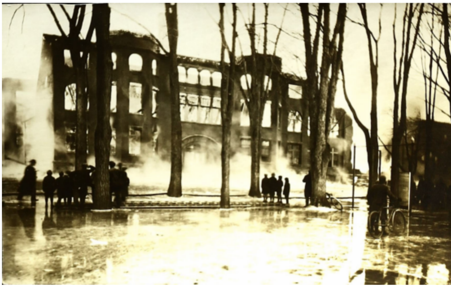
Photograph Directly After Fire 1919

This photograph was taken after the fire was put-out. The rubble is settling and the crowd is thinning out. The damage had spread throughout the entire school- the building was left unsalvageable. The initial Normal School building was located on Court Street in Cortland's downtown district.