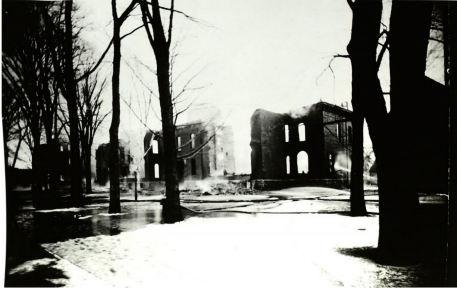
Photograph of the Ruins February 28th, 1919

the administrators and school officials had a decision to make- will the school move to Randall Flats or up on the Hill? Spoiler alert- "The Hill" was chosen. Also important to note- the students at Cortland Normal School resumed their studies on Monday- two days after the fire occurred.