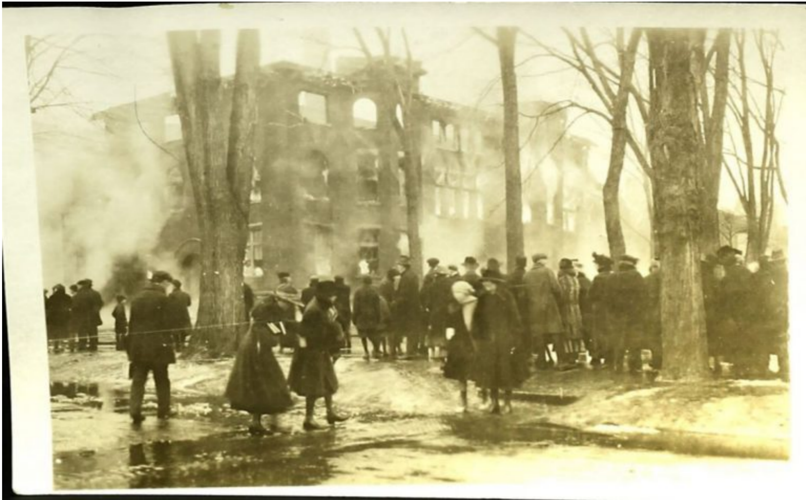
Crowd gathering to watch the fire

This photograph shows the students and community members gathering to watch the Normal School Fire. If you look closely enough, the flames are still visible. Soon after this picture was taken, the building began crumbling and caving in due to the fire engulfing the second story.