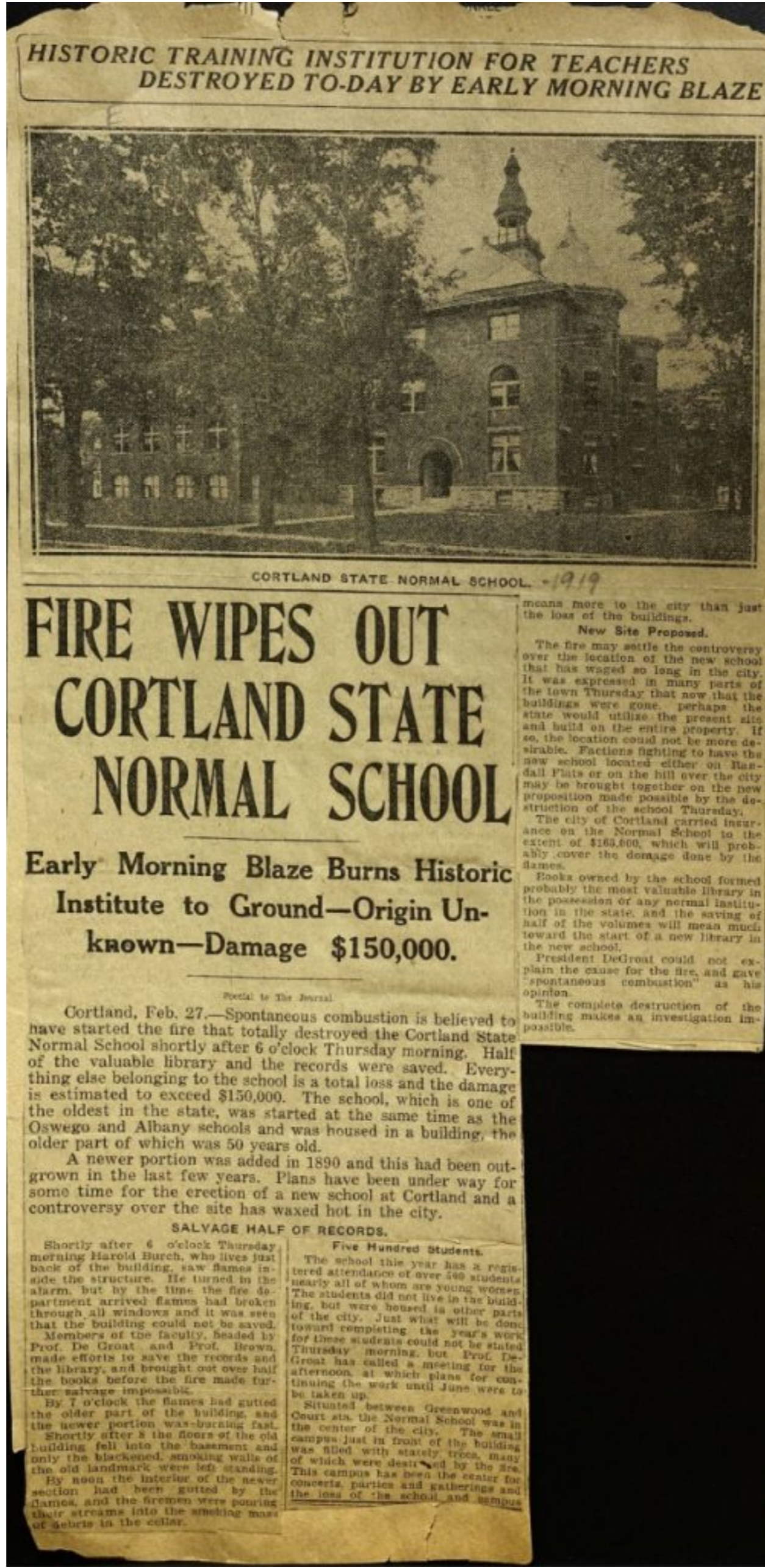
Newspaper article (possibly from the Syracuse Journal) going over the damages and potential relocations

What was strongly debated after the fire and complete destruction of the school were the new potential locations for the new college. Many people fought over where the school should be rebuilt, whether it should move to the Randall flats, go up on the hill that overlooked the city, or even just be built right where the original normal school existed. Even though the events were a tragic loss and set back for the attending students and college committee, the insurance was able to provide sufficient compensation for the damages (about $165,000 in damages).