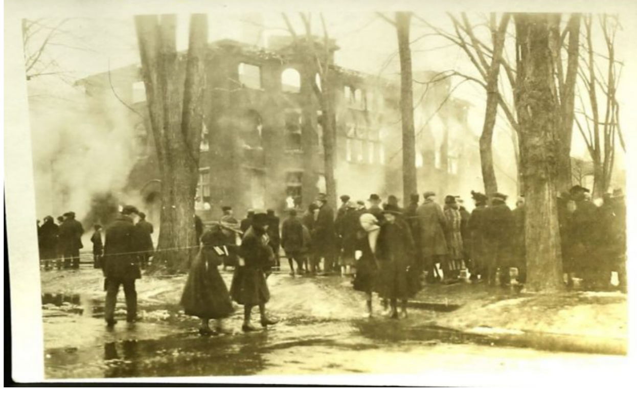
Photograph of Cortland civilians and bystanders watching the school burn

On February 27, in 1919, there was a mysterious fire that started and burned down the entire Cortland Normal school. To this day, no one truly knows what actually caused this fire, but some rumors were circulating around about possible catalysts. One of the rumors were that the back doors were left open in the morning and another rumor suggested that an individual tossed a lit match or cigarette into the paper chute within the building. Further investigation interpreted that the paper chute that stretched throughout the first and second floor of the building is what helped the fire spread so easily and quickly. Fortunately, classes were able to resume within about the next week in the Methodist Church, YMCA, Cortland High School, and Miller Club house.